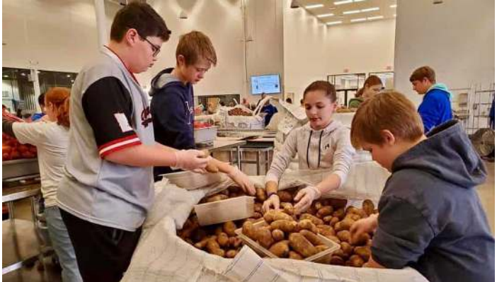
PoP's 7th and 8th grade confirmation students spent a recent Friday serving at Second Harvest and preparing for PoP's Tanzania Dinner. It was a Confirmation mini retreat on a no school day in Roseville. The kids are studying the Lord's Prayer, focusing on "give us today our daily bread."

This is the second year of a new confirmation model where students meet once a month - either on a Sunday from 4-8 pm or on a day off from school. These longer sessions allow us to go into greater depth and include service-learning activities to help students understand