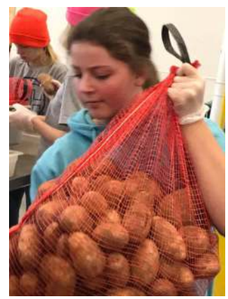
Confirmation meets next on Sunday, Dec. 8 from 4-8. The focus will be on "forgive us our sins as we forgive those who sin against us."