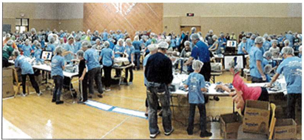
Panoramic view of the FMSC MobilePack at Incarnation Lutheran Church