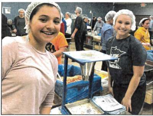
PoP Rocks Youth Group packed meals at Feed My Starving Children in February.