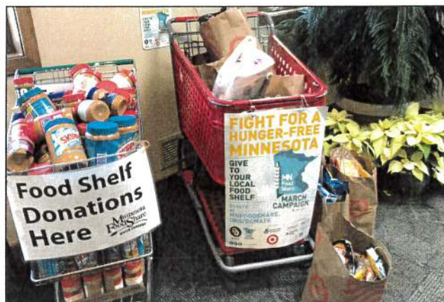
All this peanut butter and food was collected, plus $2,638 in donations.

A HUGE thank you to all who participated in this drive to help feed the hungry in Minnesota.