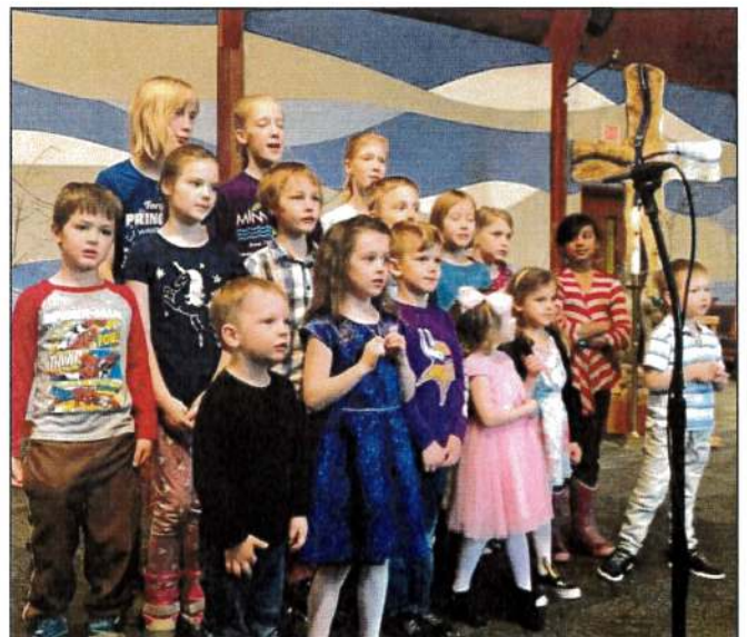
The Sunday School Choir leading the congregation in song March 24.

Good Friday, 4/19/19 at 11 a.m. service Sunday, 5/19/19 at 10:45 a.m.